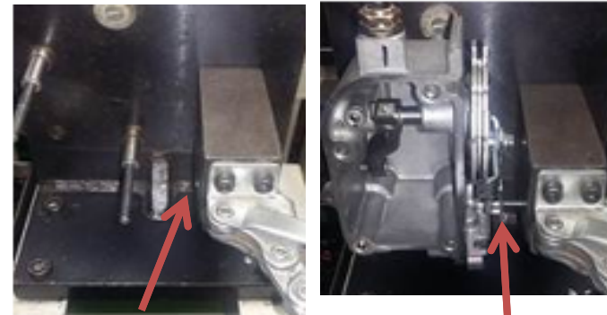
No provision to arrest LRL revers slot in fixture